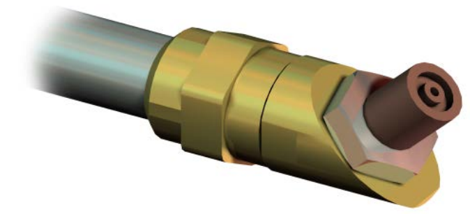
Metco 6PT-II 45° Spray Head

For a complete list of optional parts and spare parts, please refer to the parts lists section of the reference manual.